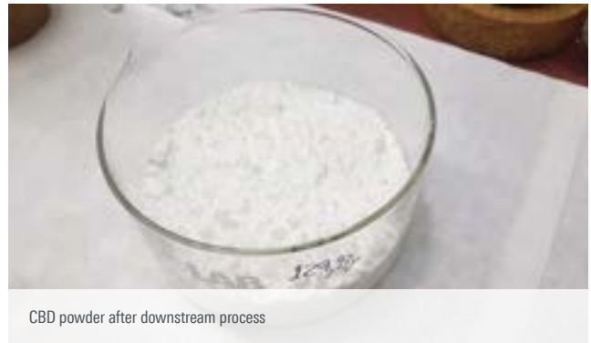
CBD powder after downstream process