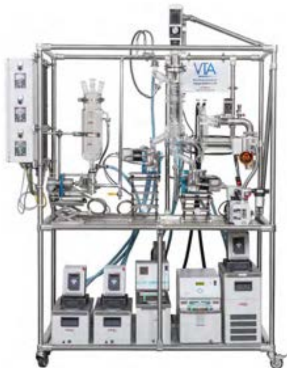
Short Path Distillation System VKL 70-4 FDRR

VTA also works with Root Sciences in North America in the cannabis and hemp processing market. Together, they optimized the systems for continuous production and developed features, like GMP documentation and control systems. Hellamco and VTA trained Prof. Skaltsounis' team in the operation of the unit.