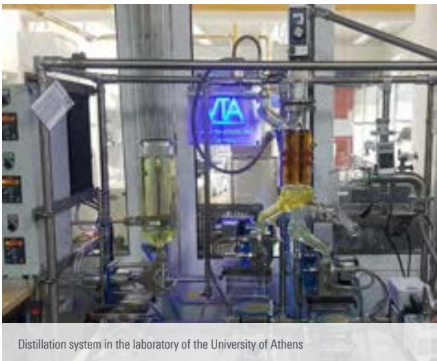
Distillation system in the laboratory of the University of Athens